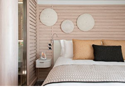
Grand Deluxe Suite Deck 6