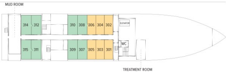
Category 1. From