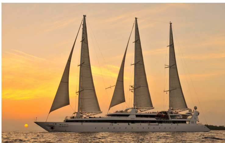
he Sun Deck

Spa / massages (18.5 m 2 ): one cabin offering massages and Biologique Recherche treatments - Gym (16 m 2 ) with dedicated fitness instructor - Yoga sessions on the Sun Deck