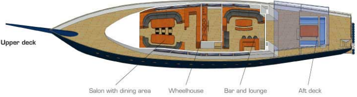
SY Sea Bird