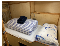
Twin Cabin Semi En-suite