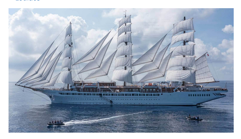
, 4 zodiacs

Generous wellness and spa area with two treatment rooms, Finnish sauna, steam bath, relaxation room, multi-sensory shower as well as various massages, beauty parlour and hairdressing salon, fitness area with ocean view and the latest cardio equipment, swim platform, watersports equipment, 4 zodiacs