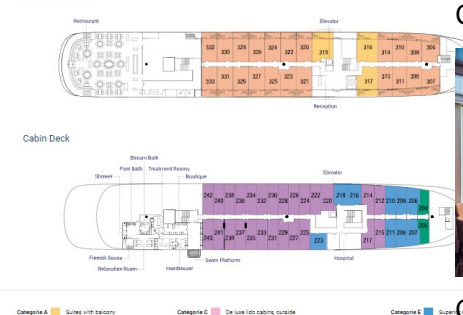
Category E: Superior cabins, outside. From