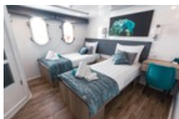
Lower deck cabin