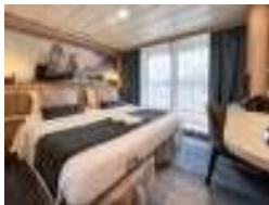
Studio Veranda Single