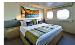
True North II - Ocean Class - Twin