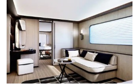
MISTRAL JUNIOR SUITE