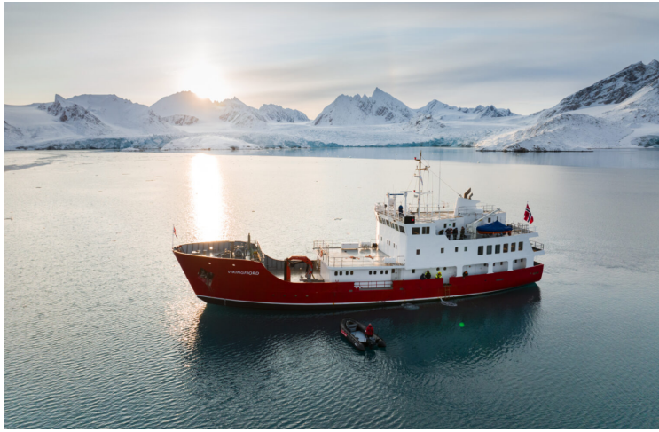
e bow deck.