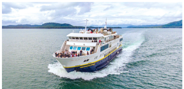
nce at sea.

On board, guests enjoy spacious public areas including a lounge with bar and presentation space, a dining room with open seating, a Global Gallery, fitness centre, and a furnished sundeck. A mudroom with lockers keeps expedition gear handy, while the open Bridge invites guests to learn from the Captain and crew. With twin Zodiac platforms for efficient embarkation, Venture is ideally suited for spontaneous wildlife encounters and exploration by paddleboard or kayak. Her design, informed by over 50 years of expedition expertise, ensures an immersive, flexible, and unforgettable experience at sea.