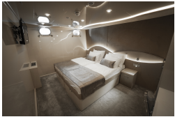
Upper Deck Cabin with Balcony