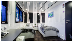
Main Deck Cabin (one available)