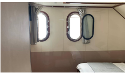
Main deck single