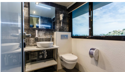
Upper Deck Cabin with Balcony - ANTARIS