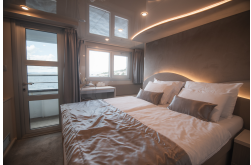
Upper Deck Cabin with Balcony