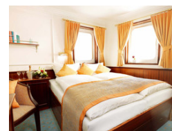
Captain's and Lido Deck