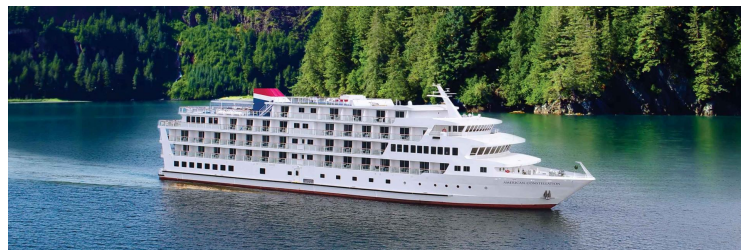
o All Decks