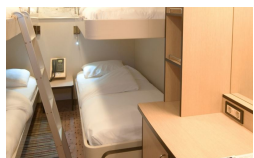
Polar Inside. From