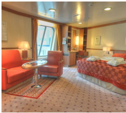
Polar Inside. From Polar Outside. From