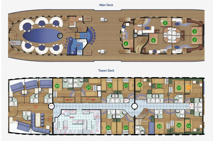
Main Deck Cabin. From Tween Deck Cabin. From