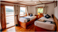
Main Deck Twin Sharing Upper Deck Twin Sharing