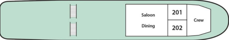
UPPER DECK PLAN