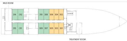
Category 1. From