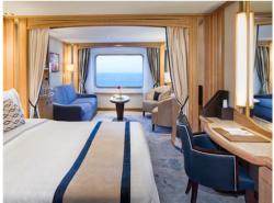
Owners Suite - From Star Porthole - From