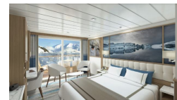
Balcony Stateroom Category B