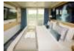
Owner's Suite. From