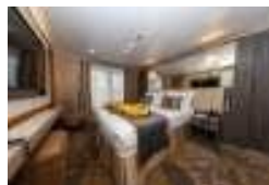
Deluxe Veranda Forward