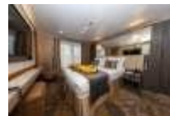
Deluxe Veranda Forward Stateroom