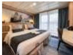
Studio Veranda Single