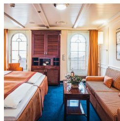
Category C: De luxe lido cabins, outside. From