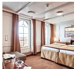
Category B: Junior suites with balcony. From